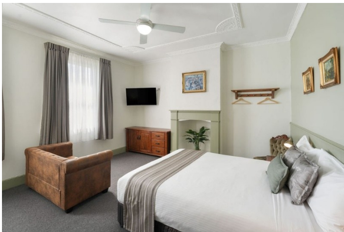
Deluxe Heritage Queen Room