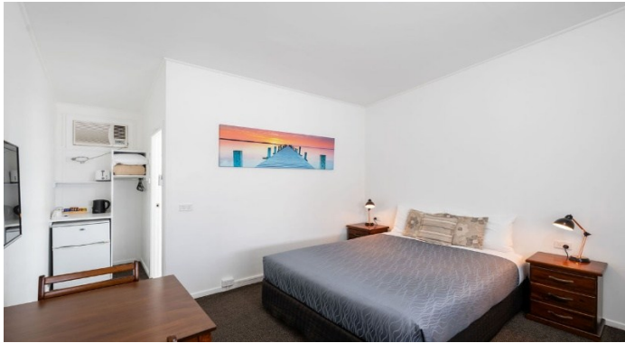
Motel Queen Room