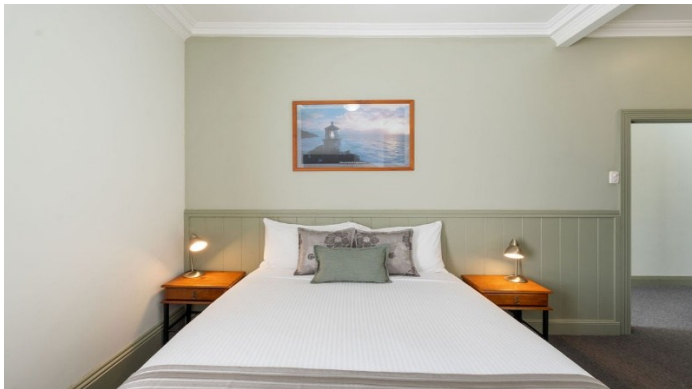
Heritage Queen Room